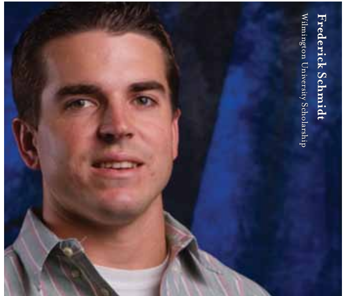
Frederick Schmidt Wilmington University Scholarship